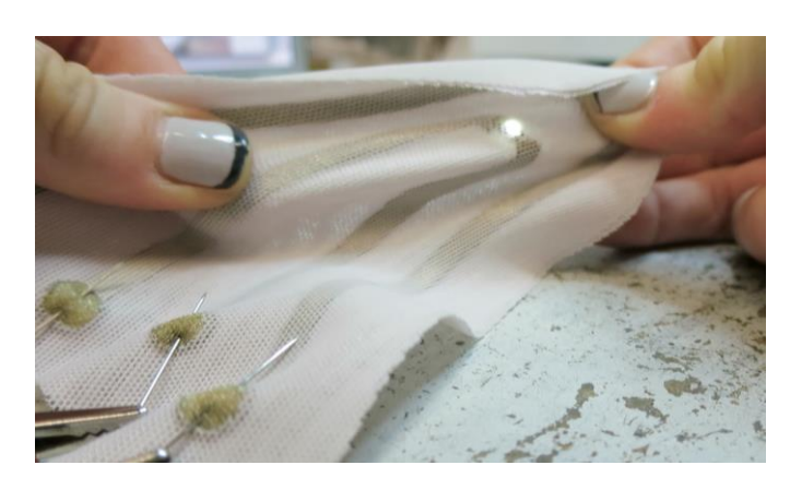
Figure 1: Testing the elasticity of a stretch circuit panel. The LED and button are inserted into tiny unbonded pockets, through tiny slits the back of the fabric, and secured with conductive thread. Please refer to our video figure to see the sample being stretched.