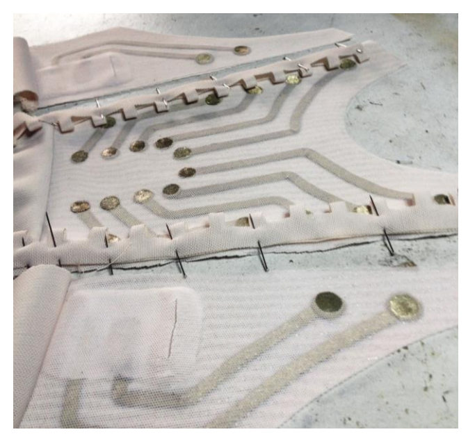
Figure 6 - Work in progress. Detail of Toile #2, sewing the eTextile panels into the garment

prototyping and garment production. Figures 4 & 5 show the process of combining individual pieces of fabric with conductive traces into a larger garment.