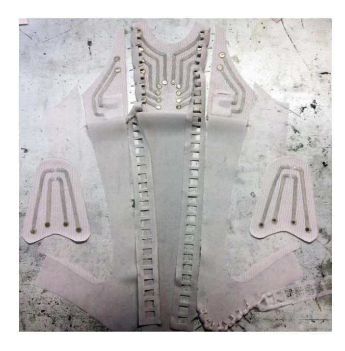
Figure 5 Toile #2:Second Skin pattern piece layout showing assembled eTextile panels and laser cut ladders to house tubing for cables

To accommodate the constraints set by designing for physical performers, Rachel opted to develop techniques established for high performance sports fabric. All textiles used in Second Skin are chosen for their low profile and their ability to stretch equally in all directions. Conductive stretch fabric (e.g. Shieldex Technik-Tex P-130 silver plated lycra – Figure 3) is used for creating electrical connections. The conductive material is sandwiched between layers of powernet (mesh) and lycra/elastine (microknit) stretch textiles to electrically insulate them (Figure 3 & 4).