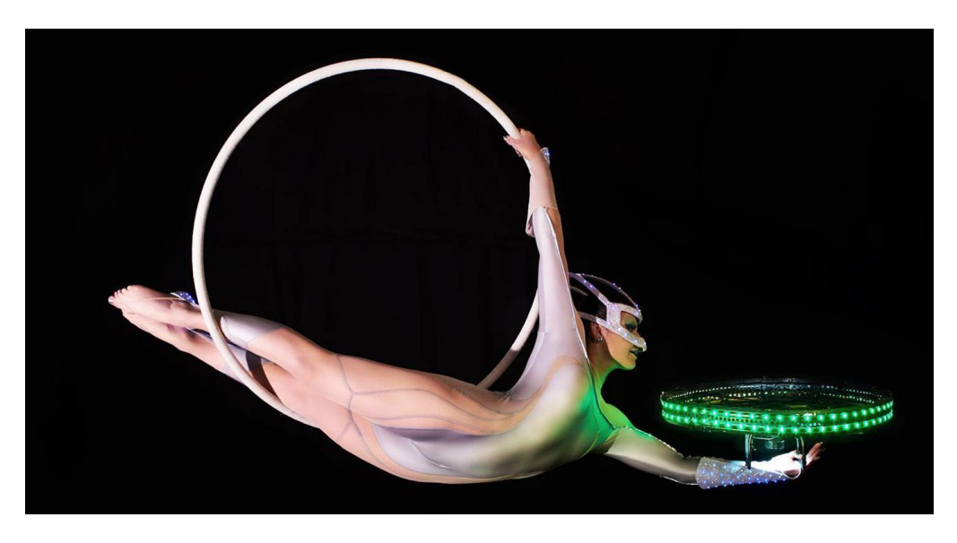
Figure 2 - Empress Stah performs a show choreographed with a drone. She is wearing a prototype Second Skin suit, testing seam lines on the body for placement and strain relief. Headpiece and cuffs incorporate eTextiles. The intent is to have a fully addressable eTextile suit which can be synced with the drone.