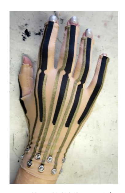
Figure 7- Fabric concept for eTextile mi.mu glove (http://mimugloves.com/) which inspired the second skin project (2015)

Second Skin does not have inherent uses in and of itself, but instead is looking for design functions to be added to the structure to test it's theory and application.