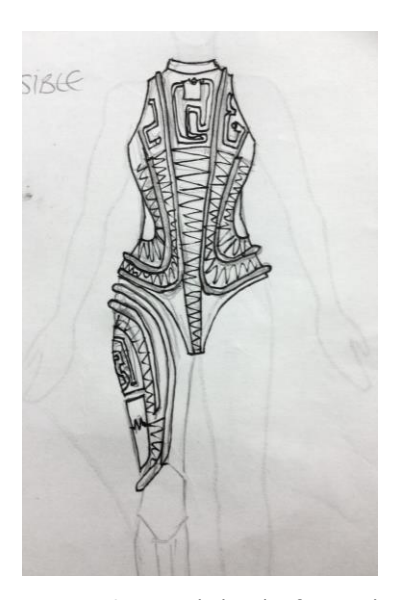
Figure 8 - Initial sketch of second skin design, imagining how to place cable housing and eTextile panels on the body. Aesthetic inspired by high altitude flight suits and pressure suits