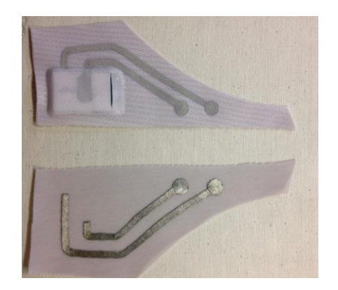
Figure 4 - eTextile battery pouch detail

design challenge in which students presented self-made superhero outfits. An exploration that not only merges electronics with clothing, but additionally blends the clothing with the body is Monarch by Kate Hartman [3]. She uses EMG signals to actuate her garments, providing users with additional expressive modalities.